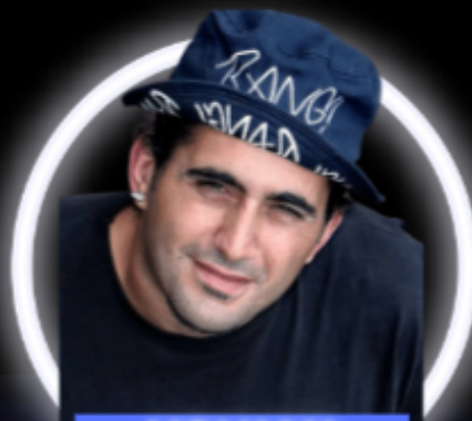
VOLKAN OLD SCHOOL HIPHOP / ALL LEVELS