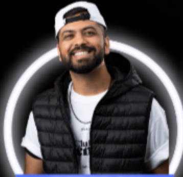
REETROY HIPHOP COMMERCIAL / INTER&ADV