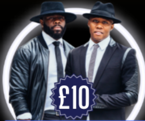
FLAWLESS HIPHOP CHOREOGRAPHY / ALL LEVELS