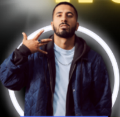
ROWDY EYEZ KRUMP BASICS / ALL LEVELS