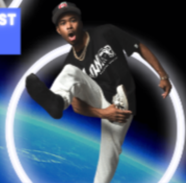
MR YOUTUBE LITEFEET / INTER & ADV