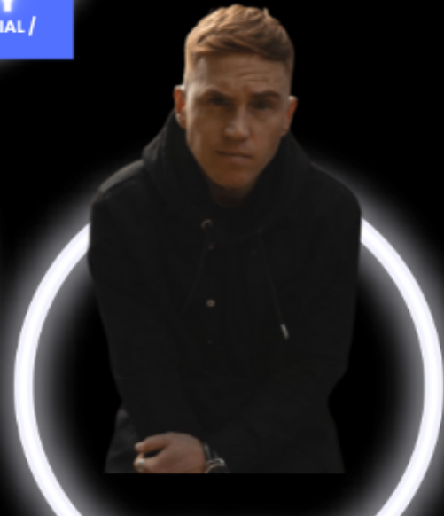
KANE SILVER COMMERCIAL / ALL LEVELS