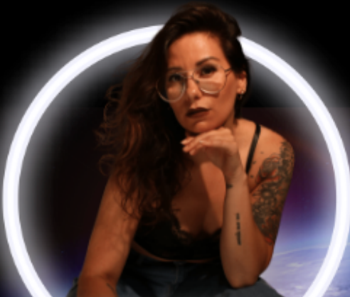
SAMANTHA FUSION CHOREOGRAPHY / ALL LEVELS