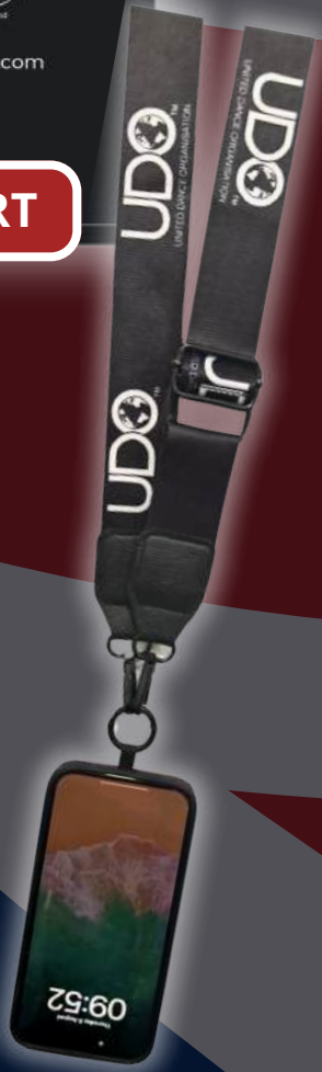
UDO PHONE STRAP

PLEASE COLLECT YOUR TEACHERS FREEBIES AT UDO RECEPTION!