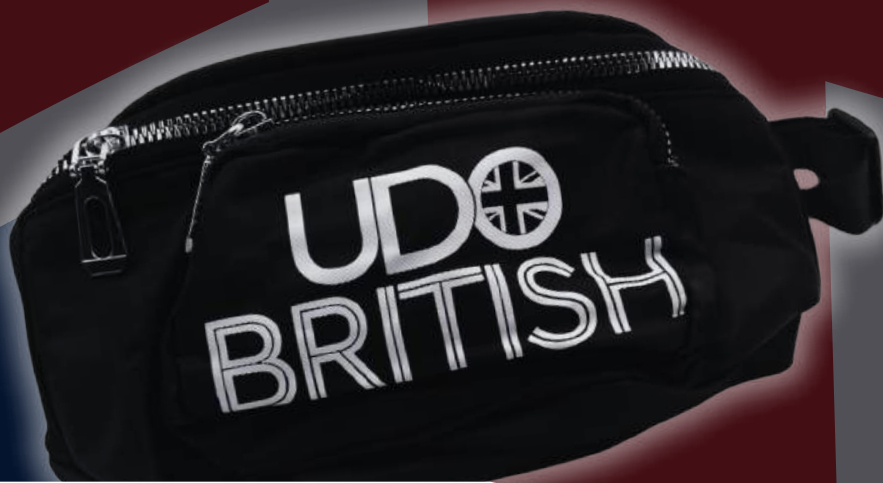
UDO BRITISH BUMBAG