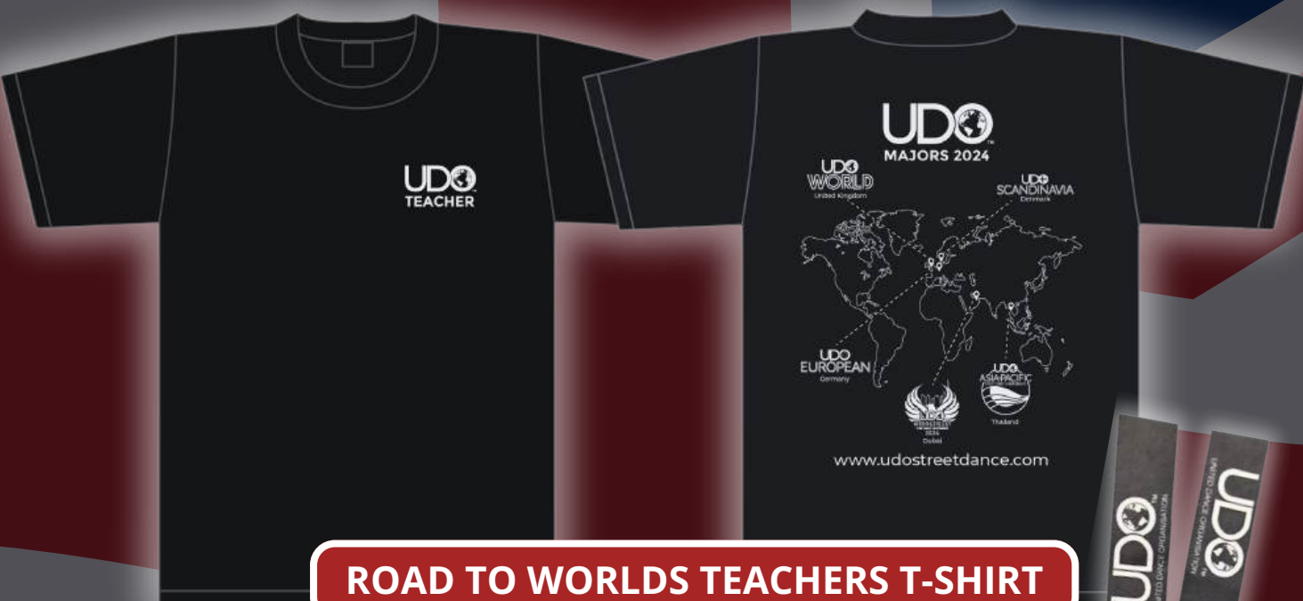
ROAD TO WORLDS TEACHERS T-SHIRT